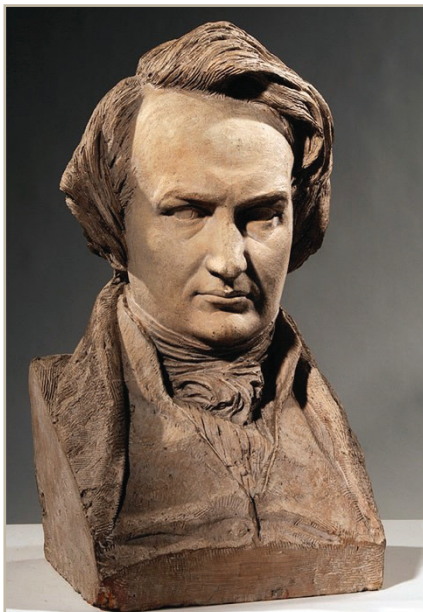
David d'Angers, Victor Hugo , colossal hermes bust with tie, terracotta, Angers, Galerie David d'Angers.

This plaster, the only one we have identified with the signature, the year and the dedication on the front of the piece, can be undoubtedly considered as a gift to its patron. Because of its inscriptions, it is probably one of the first examples around 1838 when the project of the Galerie des modèles was initiated.